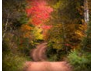
©TPEI019_BMI_Fall Scenic Road